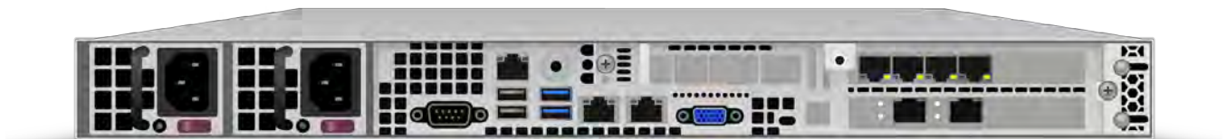
VeloCloud Edge 1000