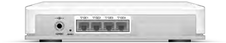
VeloCloud Edge 510