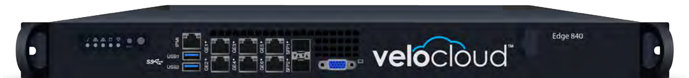
VeloCloud Edge 840