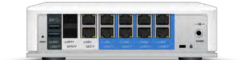
VeloCloud Edge 520/540